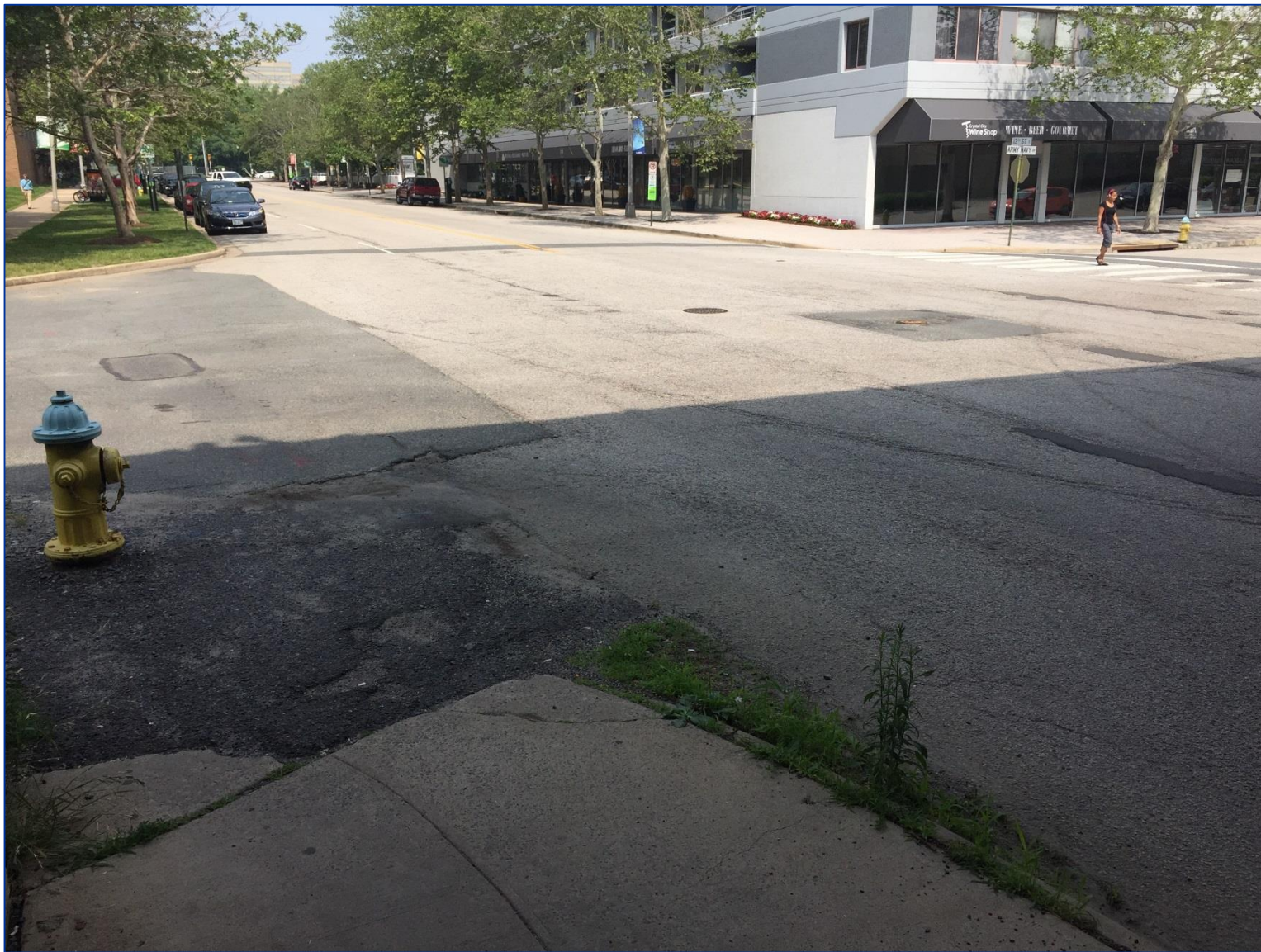
South 12 th Street Existing Condition

Arlington County's Transportation Division is seeking your input on the future of S. 12 th Street from S. Eads Street to S. Clark Street as we plan to reconstruct it into a part of the future Transitway extension to Pentagon City.