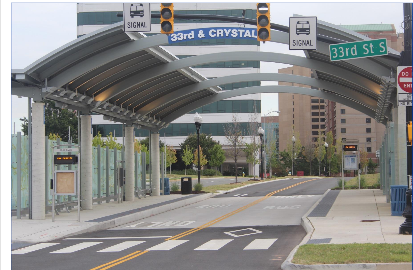
Dedicated Metroway lanes in Potomac Yard