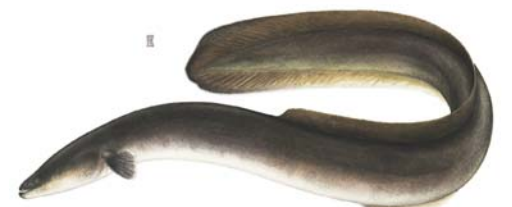
▲ American Eel