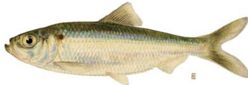
▲ River Herring