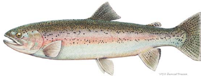
▲ Rainbow Trout stocked