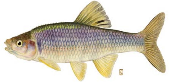
▲ Spotfin Shiner