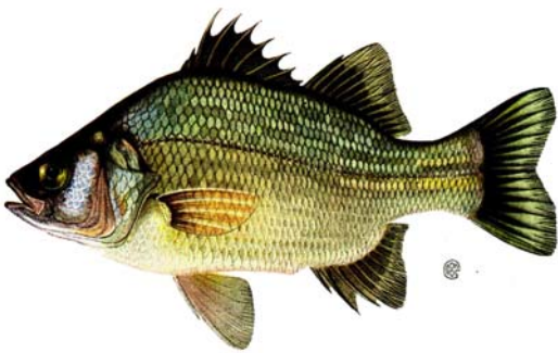
▲ White Perch