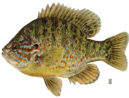
▲ Pumpkinseed Sunfish