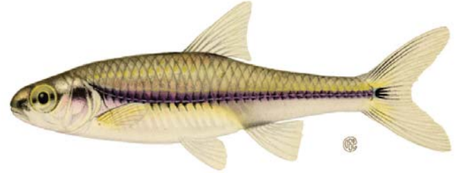
▲ Swallowtail Shiner