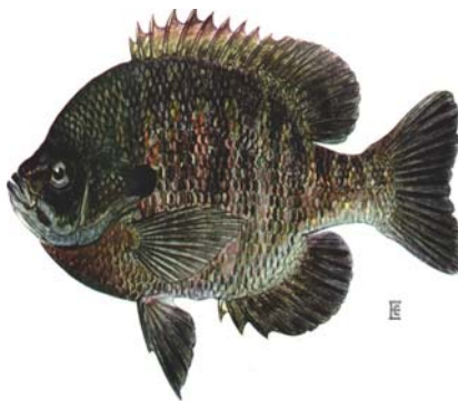
▲ Bluegill Sunfish