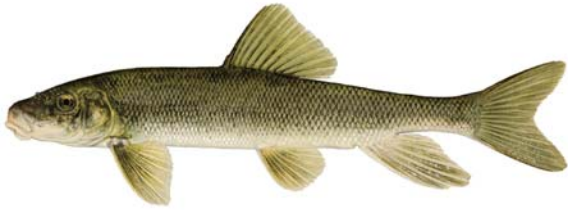
▲ White Sucker