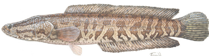
▲ Northern Snakehead