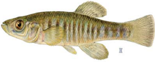
▲ Banded Killifish