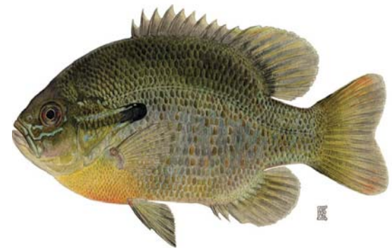
▲ Redbreast Sunfish