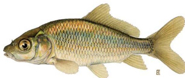
▲ Common Carp