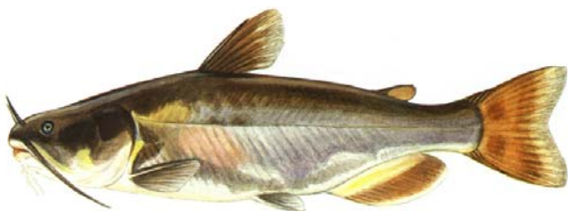
▲ White Catfish