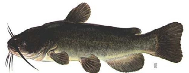
▲ Brown Bullhead