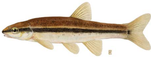
▲ Blacknose Dace

Summer, 2009 survey by Virginia Dept of Game and Inland Fisheries and Fairfax County Department of Public Works and Environmental Services Prepared by the Northern Virginia Regional Commission