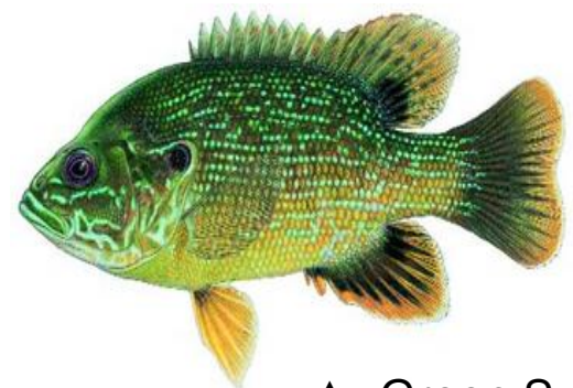
▲ Green Sunfish