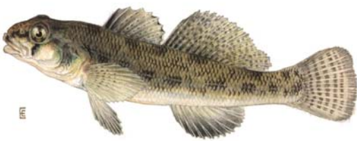
▲ Tessellated Darter